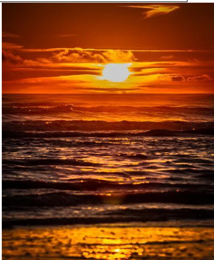
Sunrise at Baltray