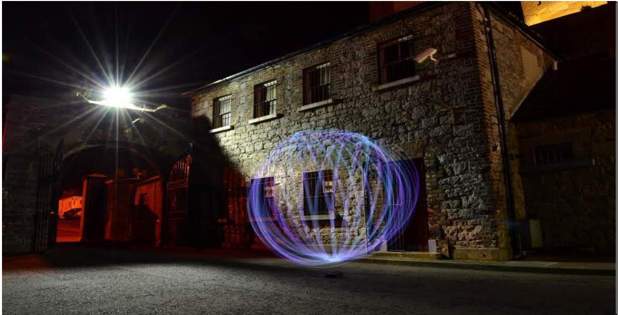
'Steel Wool Spinning' at Millmount by Helen Black