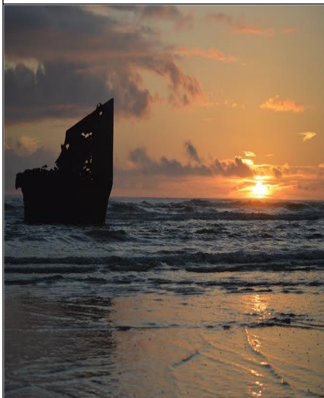
Sunrise at Baltray

In September, Old Mellifont Abbey was the venue for the Night Group outing. October's Group took night photographs from Millmount, Martello Tower, Drogheda in November, a trip to Drogheda Train Station was selected for the night outing. On 22 nd November, for a little variety and interest, Baltry Beech was visited by the Night Photography Group but this time to capture a sunrise, rather than sunset.