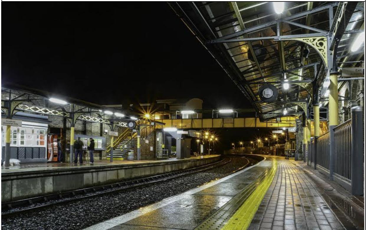
Drogheda Train Station by David Shields